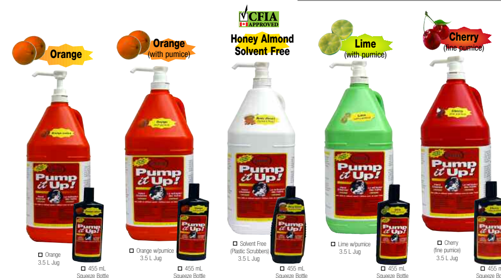
□ Orange 3.5 L Jug